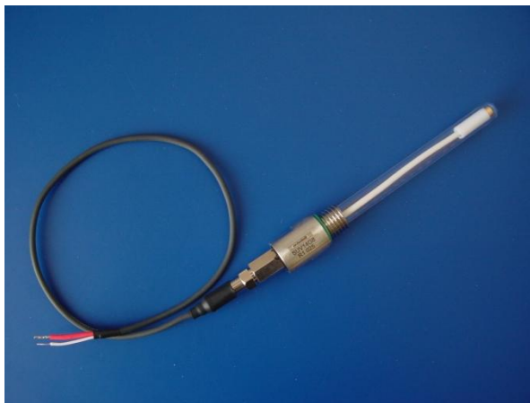
Glass sensor SUV 14 G8