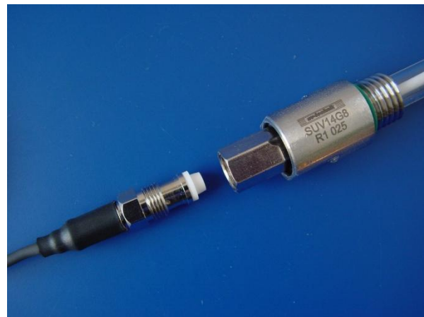
Detail: detachable cable